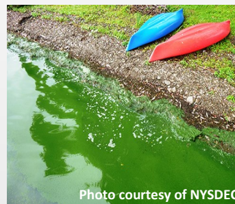
Figure 1: Harmful Algae Blooms (HABs) by County, Month of July 2018 1

View a list of reported algae blooms at: http://www.dec.ny.gov/chemical/83310.html or call Madison County Health Department at 315-366-2526.