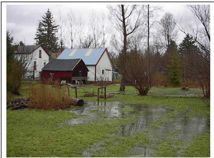
Backyard flooding behind residences on south side of Burr Street, 1/18/06.

Burr Street Area – This area has suffered flooding three times during the past ten years. During flood events, three houses on the south side and two houses on the north side of Burr Street suffer severe damages estimated at $10,000 per event. Another twelve houses on the south and three houses on the north suffer moderate damage estimated at $5,000 per event. Total damage during each flood is $125,000.