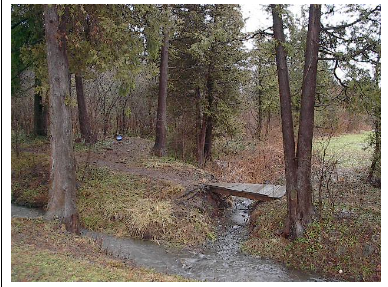
Site of proposed detention pond just upstream of Burr Street.

Carpenter's Pond – Reconstruct the earthen emergency spillway that has been filled in over time because local residents did not recognize the importance of this structure. This project would require permission from a private landowner and would cross a driveway and the gravel access road to Canal Authority property. Cost for this project is estimated at $10,000 but further study is needed to arrive at a more accurate estimate.