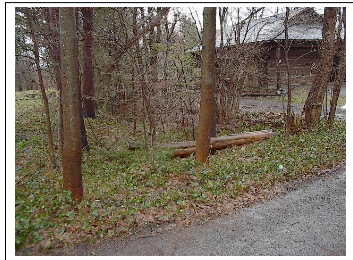
Non-functioning emergency spillway for Carpenter's Pond.

Carpenter's Pond – Reconstruct the earthen emergency spillway that has been filled in over time because local residents did not recognize the importance of this structure. This project would require permission from a private landowner and would cross a driveway and the gravel access road to Canal Authority property. Cost for this project is estimated at $10,000 but further study is needed to arrive at a more accurate estimate.