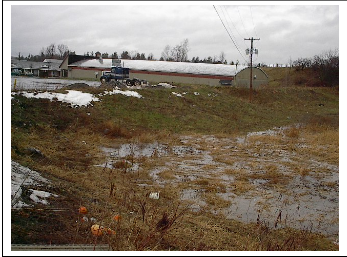
Detention Pond behind Town and Country Lanes. This photo was taken on January 18, 2006.

Fenner Road – Fenner Road is located north of the Town and Country Plaza and contributes runoff to the Burr Street area. During past flood events, the road side ditches have overflowed and deposited large amounts of debris on the road surface.