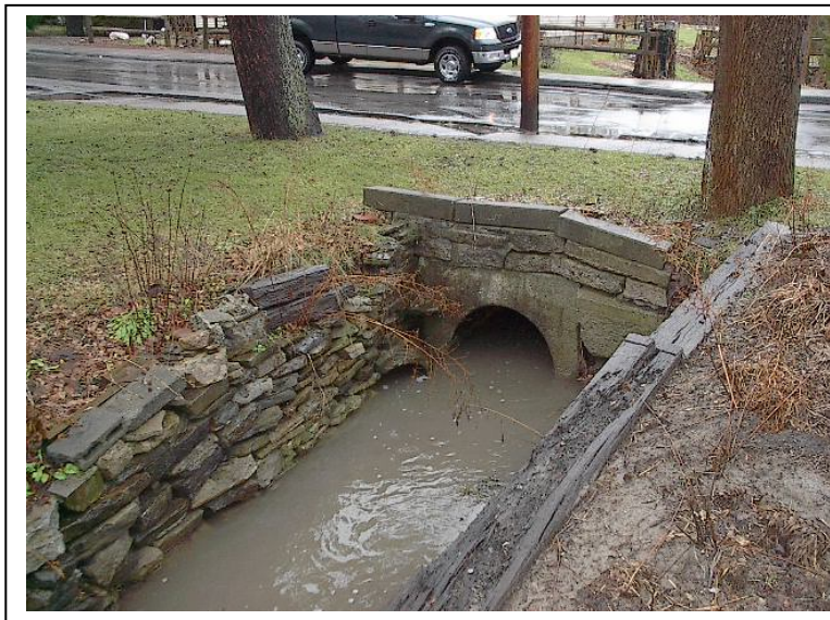
Culvert outlet at Burr Street Outlet Ditch.

Burr Street – Residences along this street have been flooded three times in ten years including January 1996, April 2001, and August 8, 2003. All of the houses on both sides of the street have had some degree of basement flooding. A tributary of Chittenango Creek flows westward behind the houses on the south side of Burr Street before turning north and flowing through a 36 inch diameter culvert under Burr Street. This small stream has a 380 acre watershed that covers the northeast corner of the Village and parts of the Town of Fenner. The Village of Cazenovia Public Works Department has reduced some of the inflow to the Burr Street area by diverting half of the flow from a Fenner Street storm drain into the detention basin west of the Town and Country Shopping Center. Additionally, an orifice plate was placed on the detention basin discharge to reduce peak flows to Burr Street.