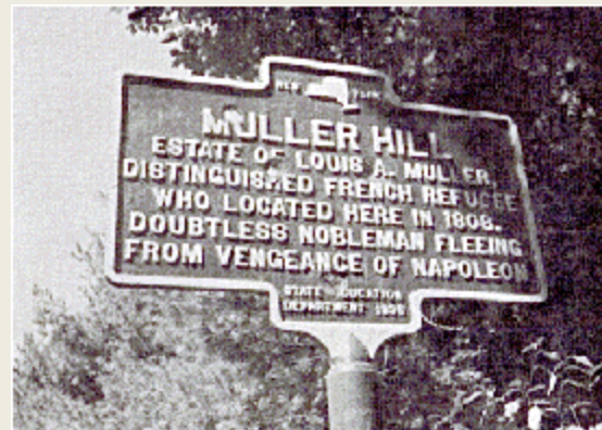
Historic site state marker located on road to Muller Hill, west of Georgetown.

In 1906 the house on Muller Hill burned down. Today the land is part of New York State Reforestation Region 7.