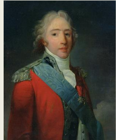
Charles X/Comte d'Artois

Or possibly he was Louis-Philippe (King of the French, 1830-1848), son of Louise-Philippe Joseph de Bourbon-Orleans and Louise Marie Adelaide de Bourbon.